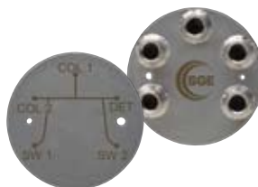
SilFlow™ GC Deans' Switch