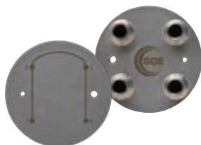
SilFlow™ GC 4 Port Splitter