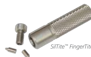
SilFlow™ Ferrules and Nut