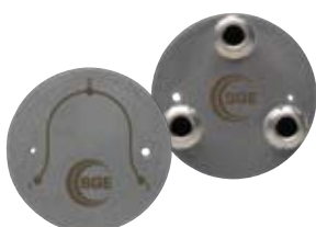
SilFlow™ GC 3 Port Splitter